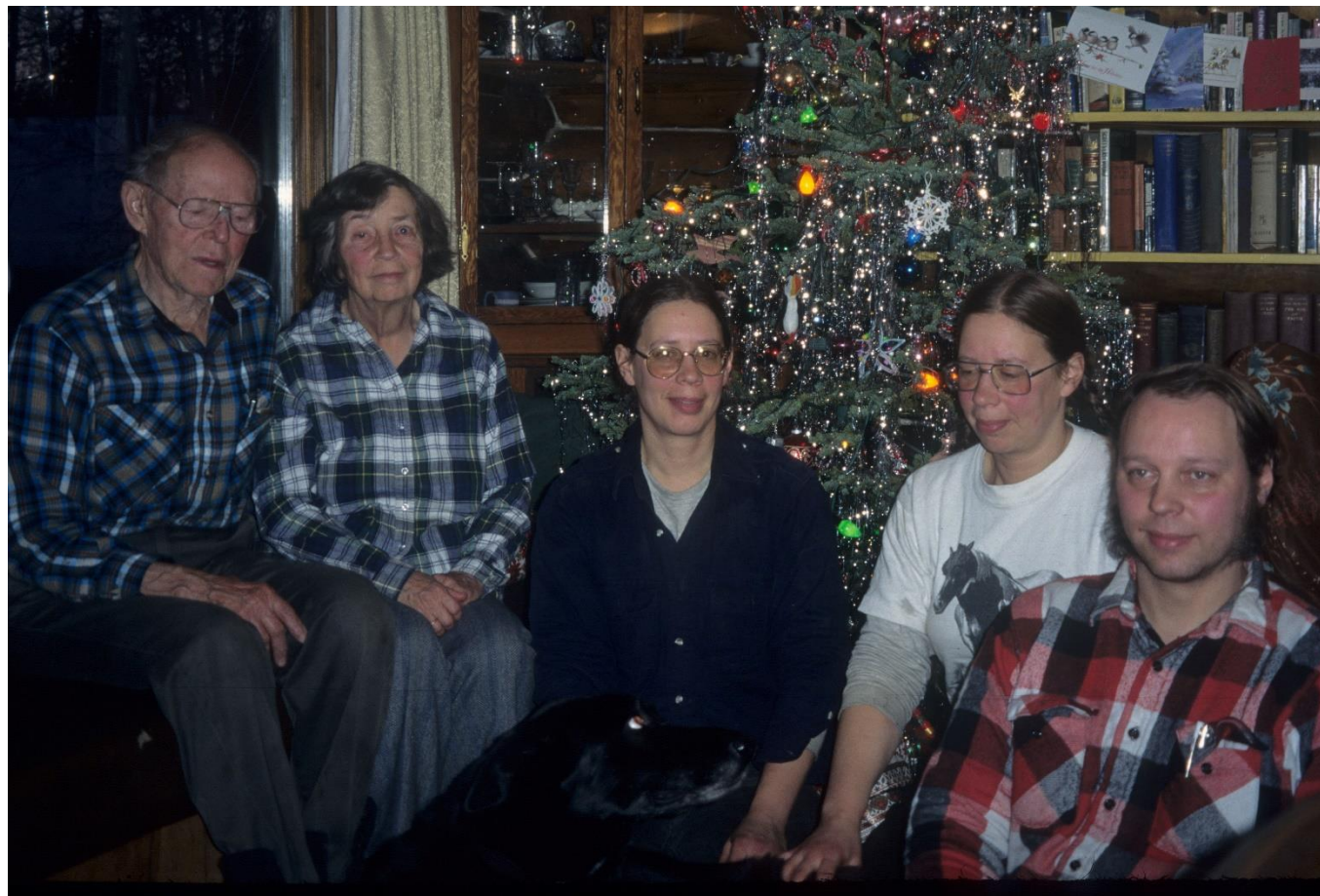
Family Christmas in Minchumina, 1995.