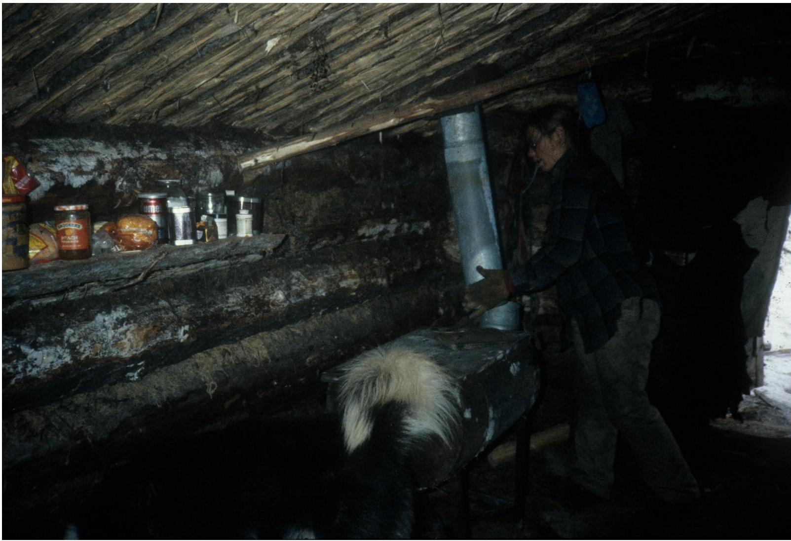
Inside Slippery Creek Cabin. November 29, 1983