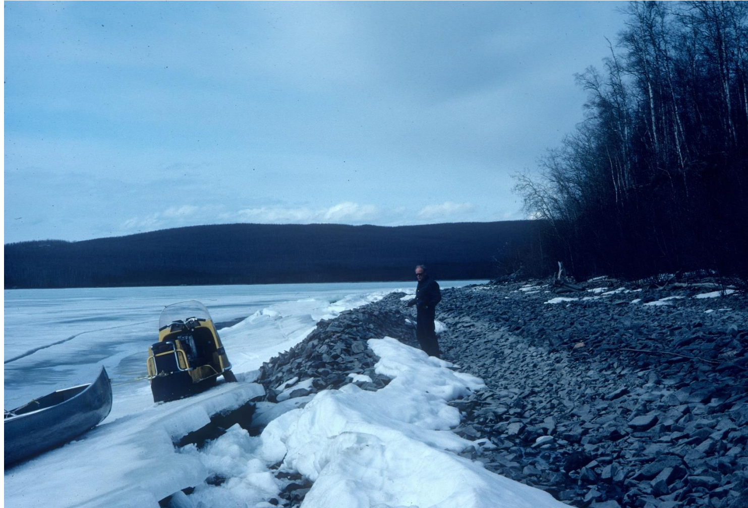
Snowmachine pulling canoe during break-up.