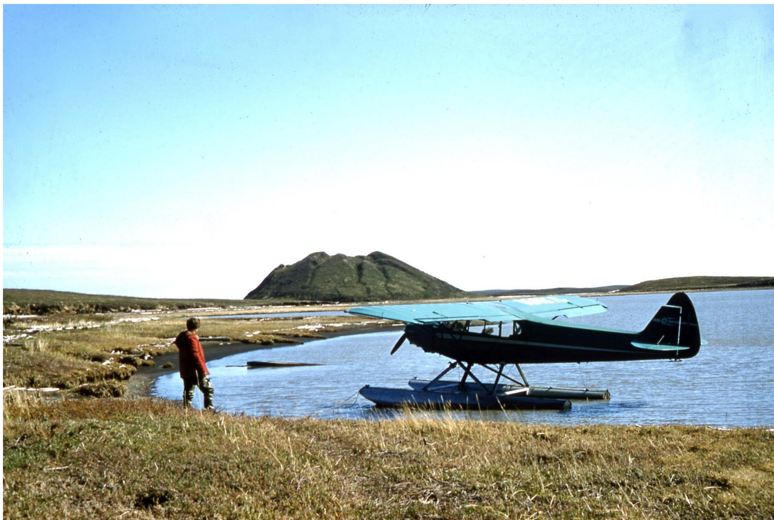
Florence and the “Green Monster”(Supercub) looking at a pingo southwest of Tuktoyaktuk. August 2, 1956