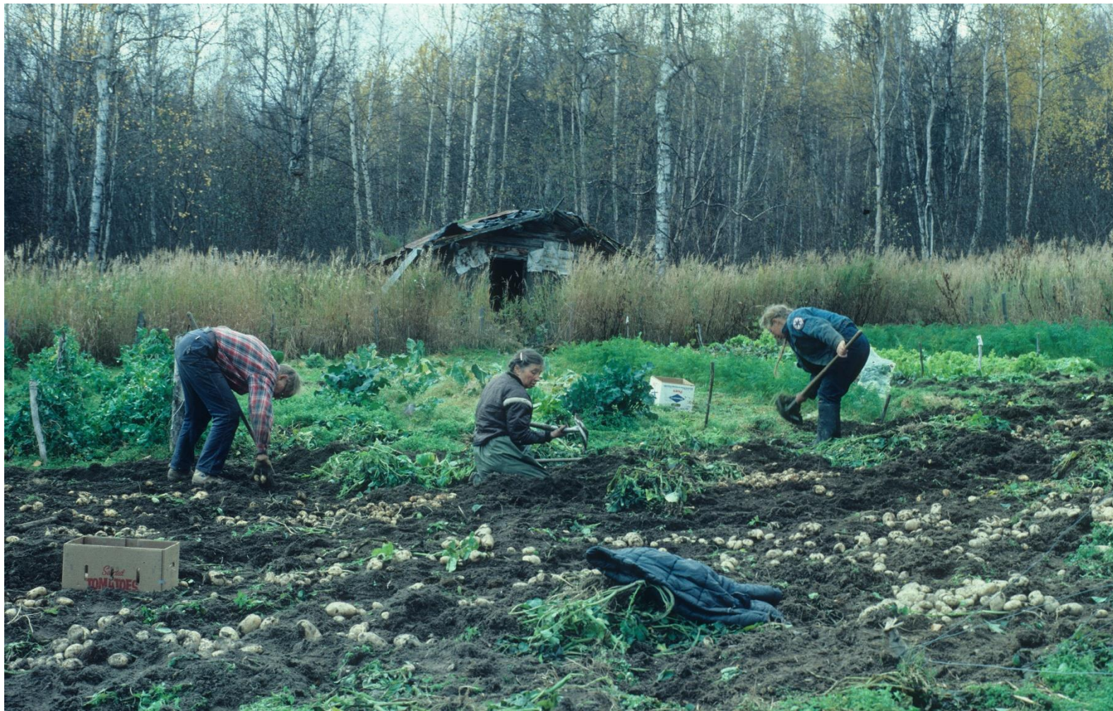
Harvesting potatoes in September 1982