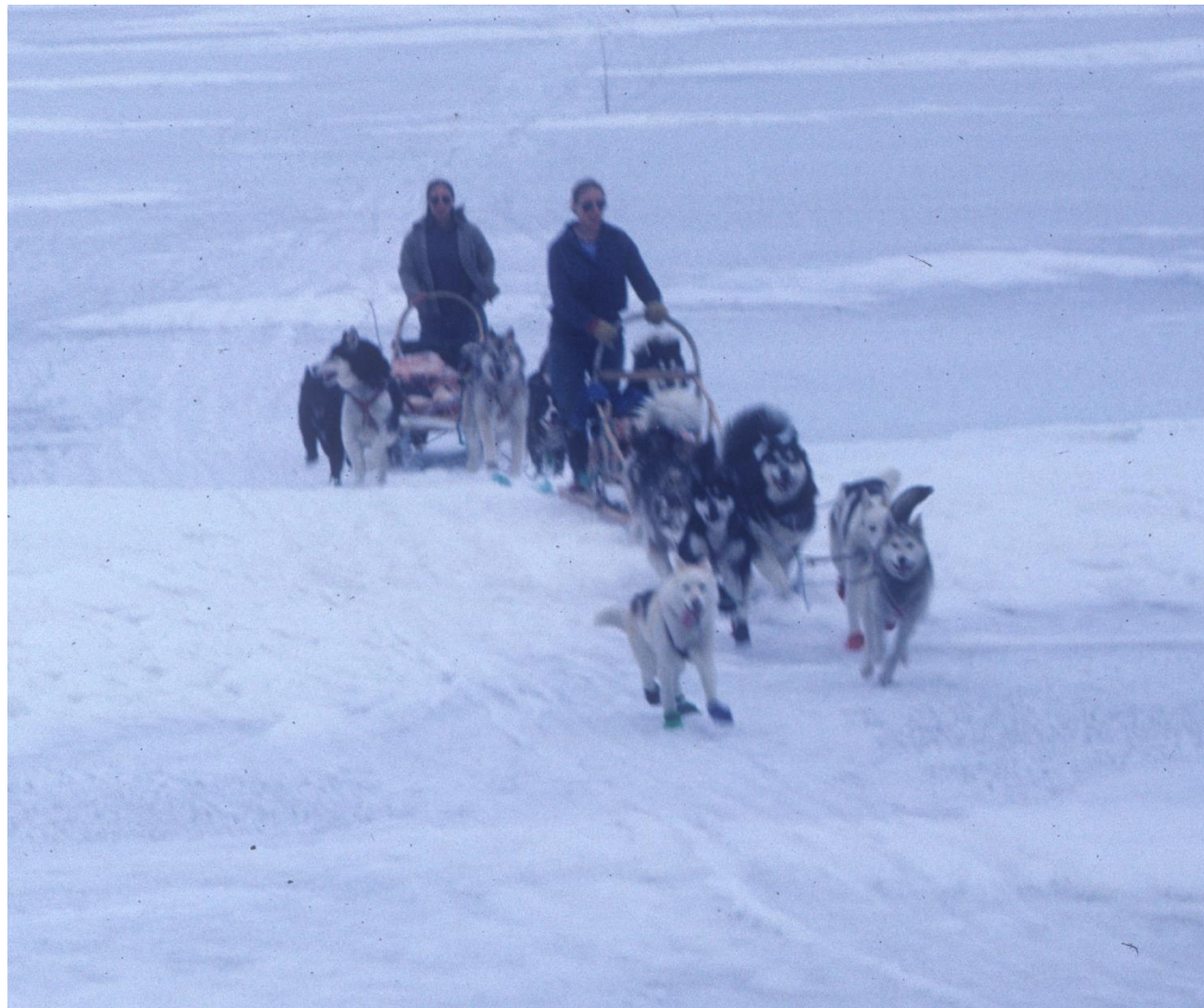
The Twins mushing on Lake Minchumina. May 1, 1986