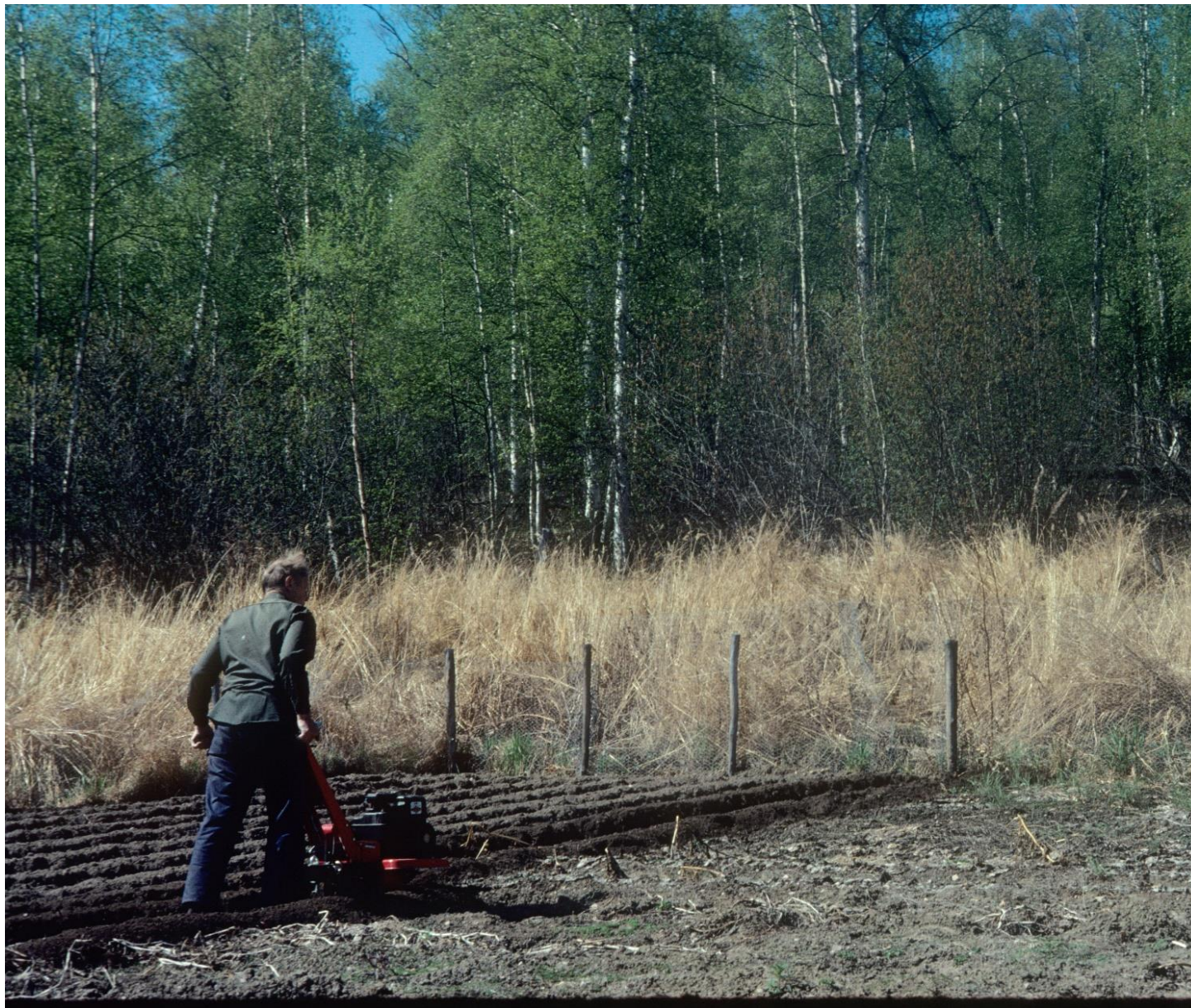
Dick plowing garden.