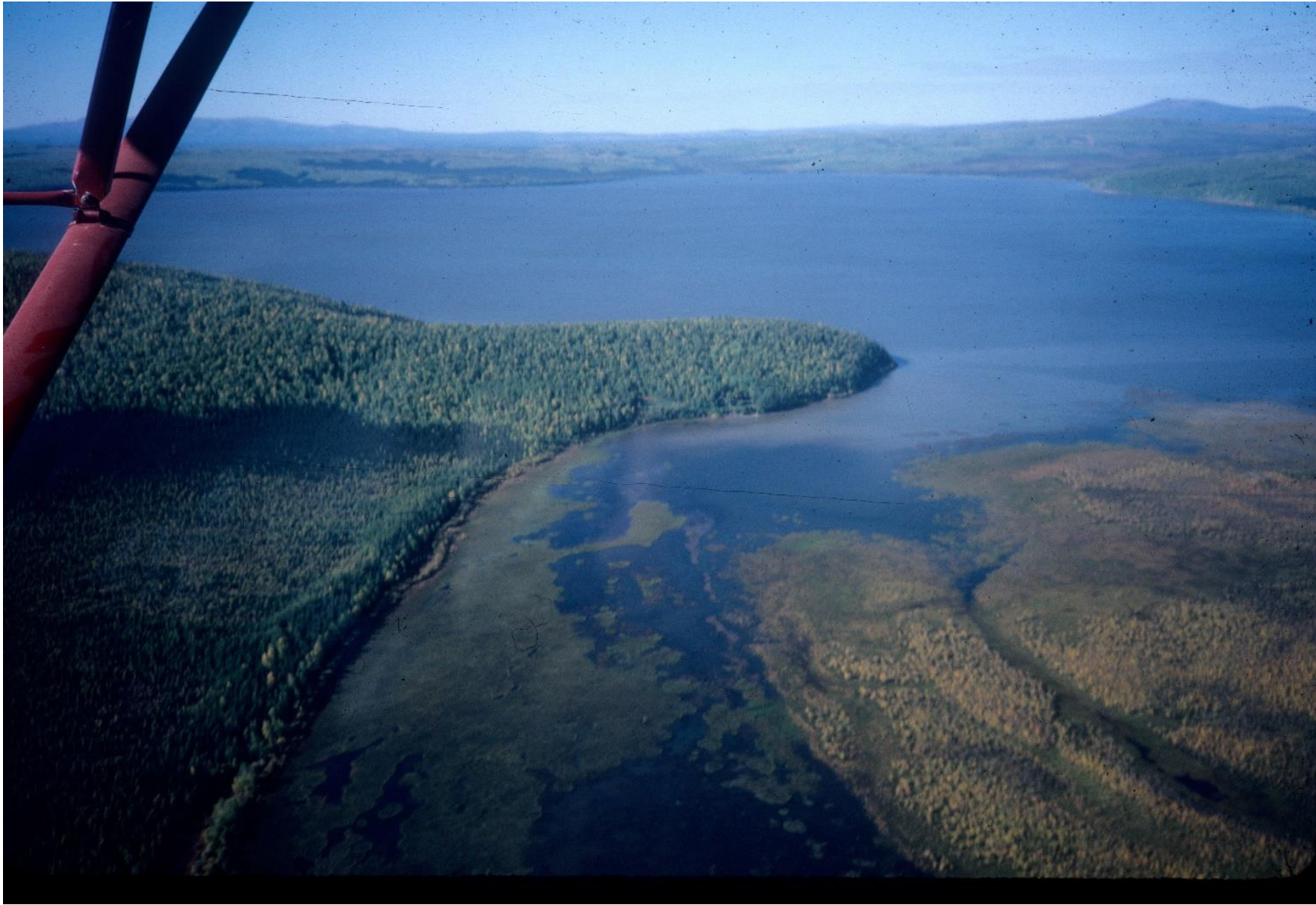
Aerial Photo of the bay on Lake Minchumina where the homestead is, before the Foraker River silted it in.