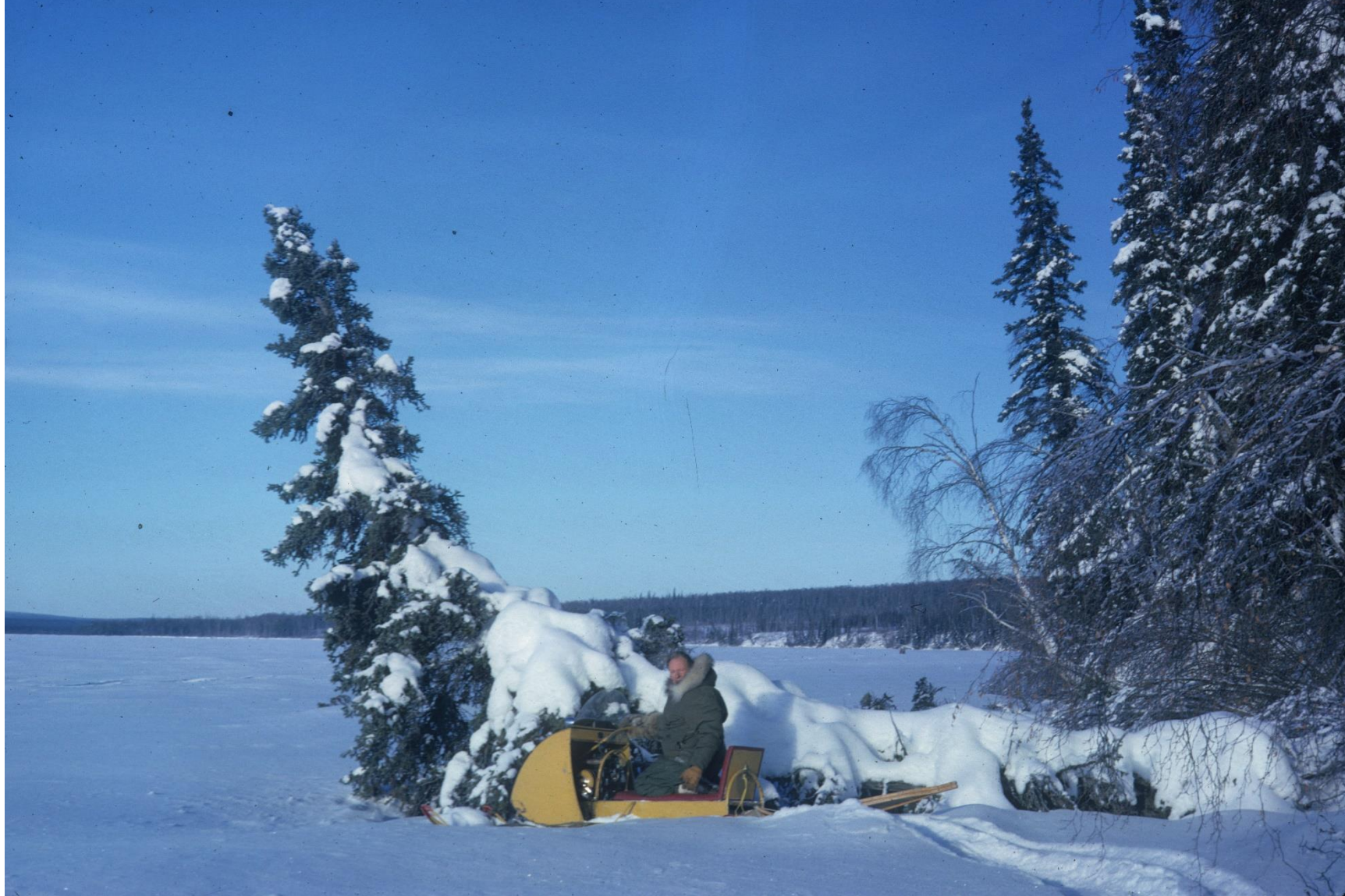
Dick on the old snow machine at Lake Snohomish (west of Lake Minchumina). February 17, 1963.